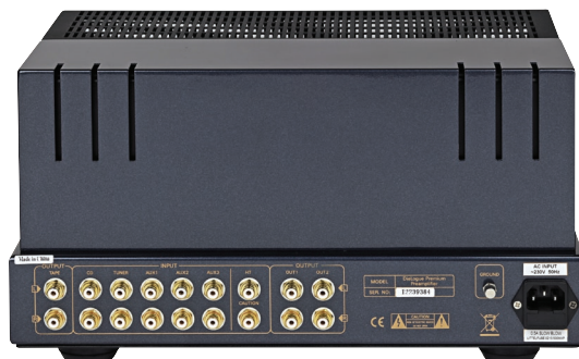
Line inputs through gold plated RCA phono sockets adorn the rear panel of the preamplifier and there are twin outputs.

Nigel Kennedy's Stradivarius had a lovely breadth of character, from resonant body to the rich, dense sound of the strings; this amplifier makes most others sound bleached in comparison. Nigel seemed to fiddle in space, as it were, as a lovely sense of atmosphere pervaded the performance supplied by ambience